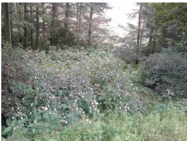
Figure 2a. Ugie 1 site - 2019