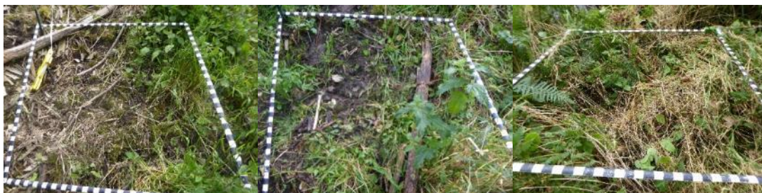
P8 – June 2019, Oct 2019, June 2020, Sept 2020