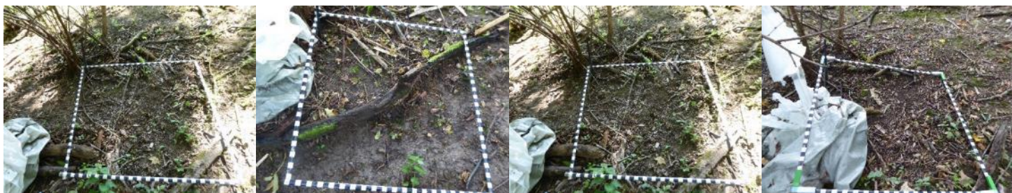
P15 – June 2019, Oct 2019, June 2020, Sept 2020