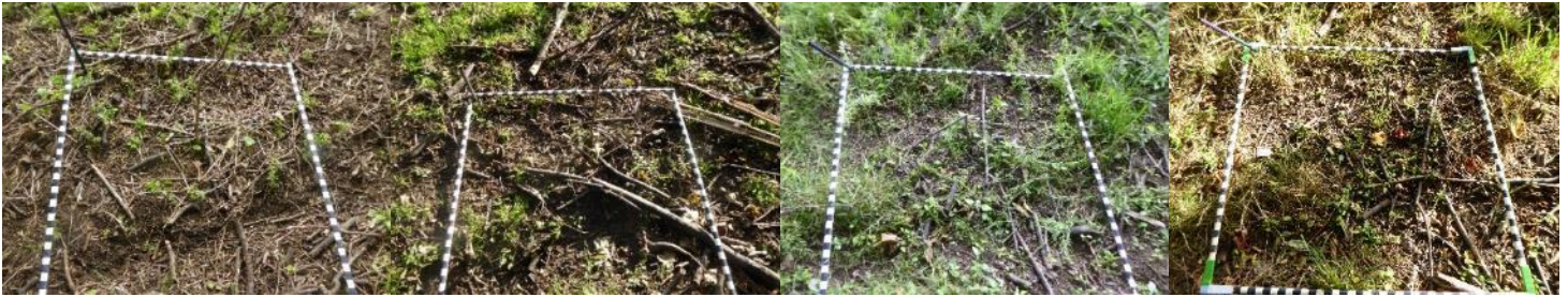
P39 – June 2019, Oct 2019, June 2020, Sept 2020