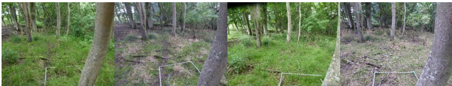
P11 - Looking up to fence

P11 looking towards wall shows how grass has grown up significantly. Still heavily grazed but sheep paths less obvious in June and Sept 2020 than in 2019