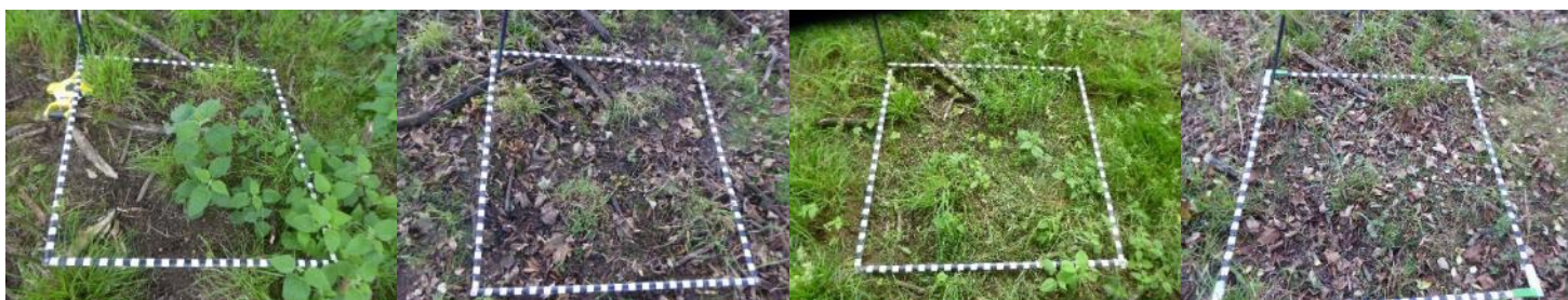
P9 – June 2019, Oct 2019, June 2020, Sept 2020