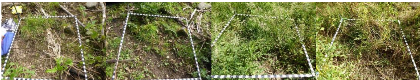
P30 – June 2019, Oct 2019, June 2020 – More grass grown up by June 2020, Sept 2020