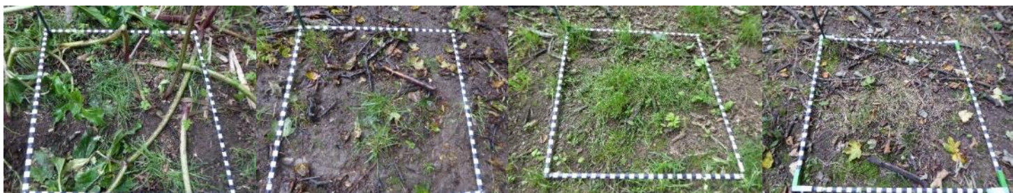
P14 – June 2019, Oct 2019, June 2020, Sept 2020