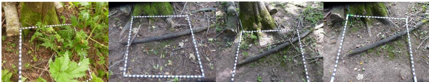
P25 – June 2019, Oct 2019, June 2020, Sept 2020

P25 looking down shows loss of large Hogweed plants and now small seedlings