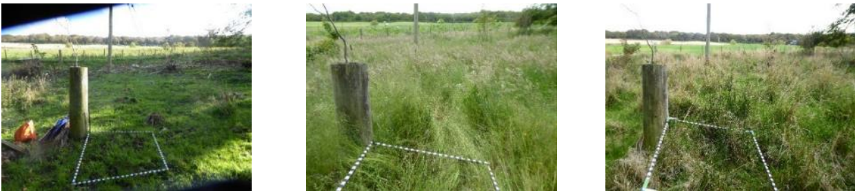
P41 – June 2019 (No photo), Oct 2019, June 2020, Sept 2020