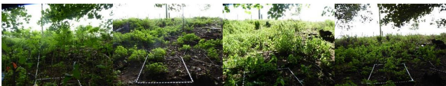
P17 —see plot photos