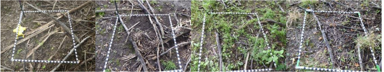
P38 – June 2019, Oct 2019, June 2020, Sept 2020