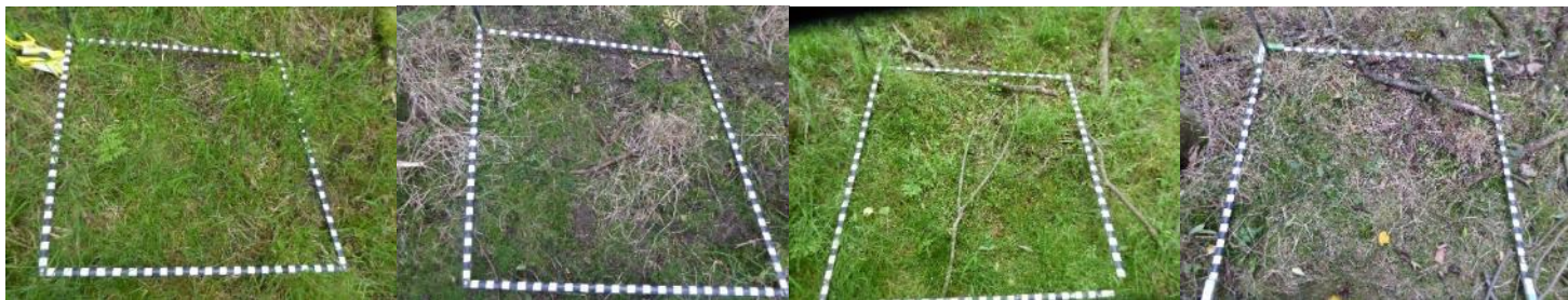
P12 – June 2019, Oct 2019, June 2020 – shows grass growing up well, Sept 2020