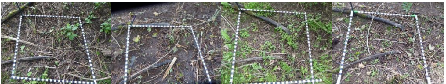
P34 – June 2019, Oct 2019, June 2020 – Hedge woundwort grazed to bare ground and then some coming back, Sept 2020