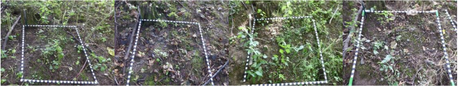
P18 – June 2019, Oct 2019, June 2020 – Not much change, Sept 2020