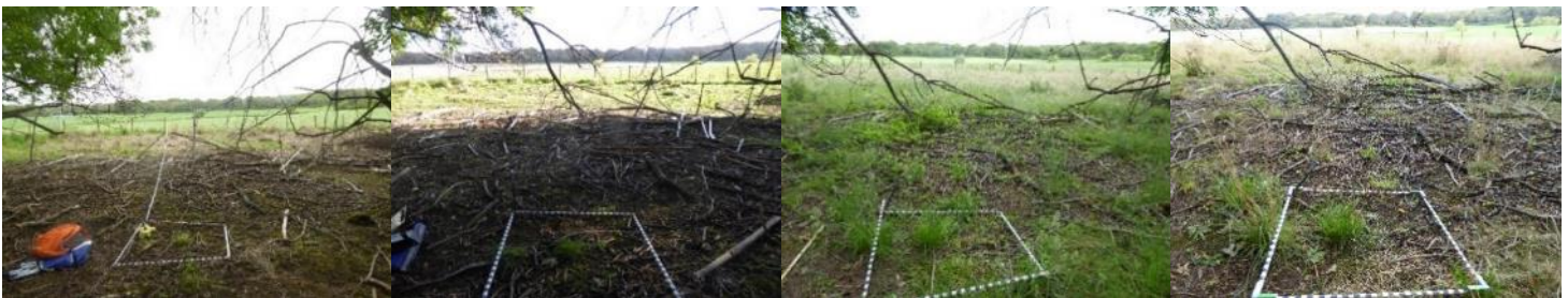
P40 – June 2019 (No photo), Oct 2019, June 2020, Sept 2020