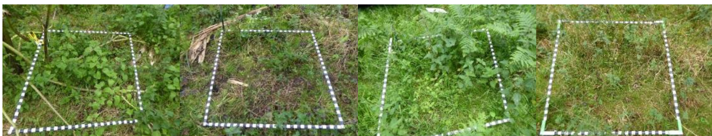
P10 – June 2019, Oct 2019, June 2020, Sept 2020