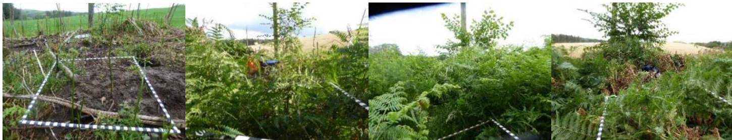
P7 – June 2019, Oct 2019, June 2020 (no close up), Sept 2020