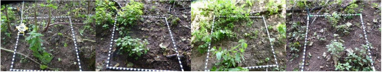
P17 – June 2019, Oct 2019, June 2020, Sept 2020