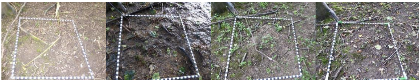
P28 – June 2019, Oct 2019, June 2020, Sept 2020