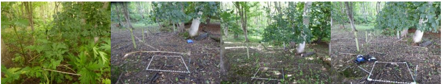
P28 - Looking uphill

Change from Giant Hogweed to bare ground