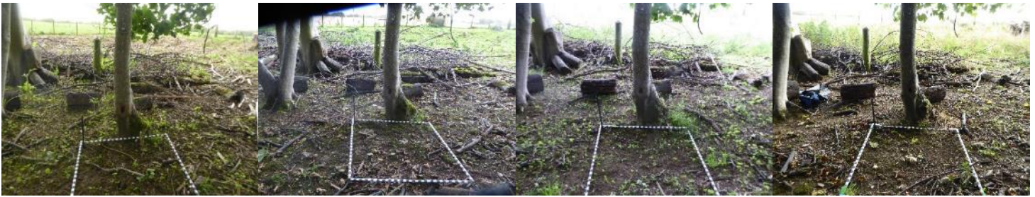
P32 – June 2019, Oct 2019, June 2020 – grasses really grown up, Sept 2020 - Looking left