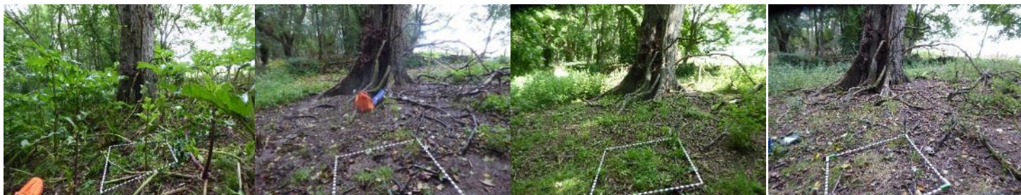
P13 - Looking up