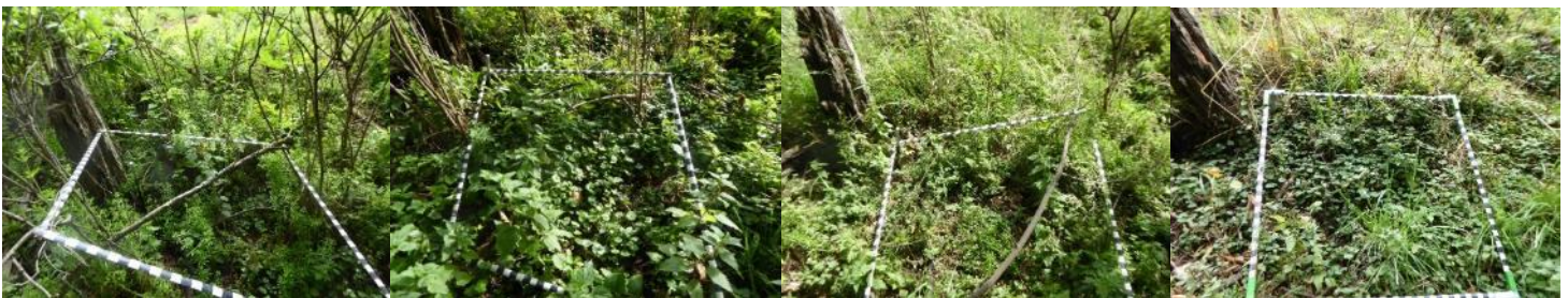
P20 – June 2019, Oct 2019, June 2020, Sept 2020

Lots of photos from October showing small seedling coming up