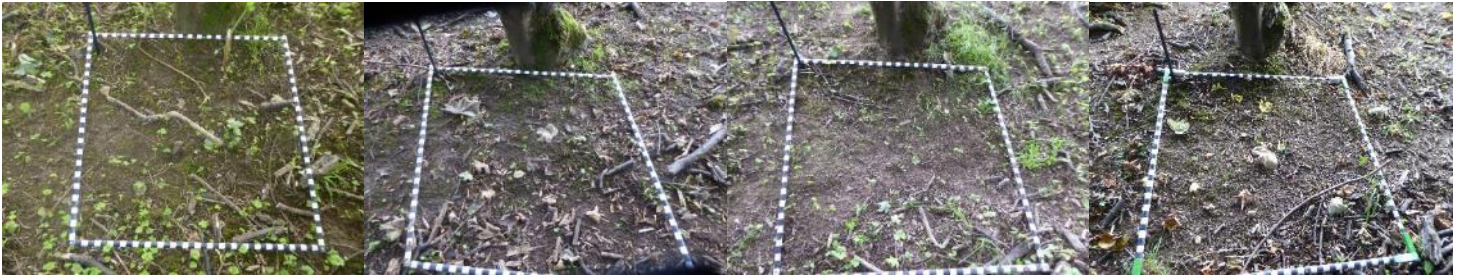
P32 – June 2019, Oct 2019, June 2020 – Revegetating with grass, Sept 2020