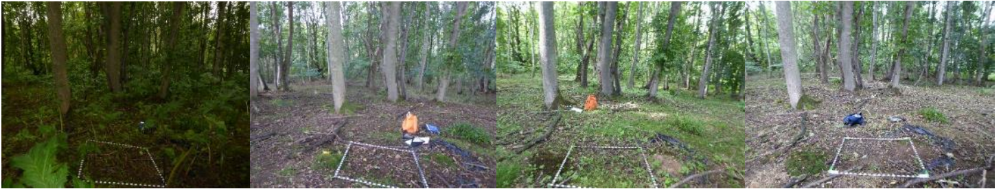
P25 - Looking up showing black plastic debris