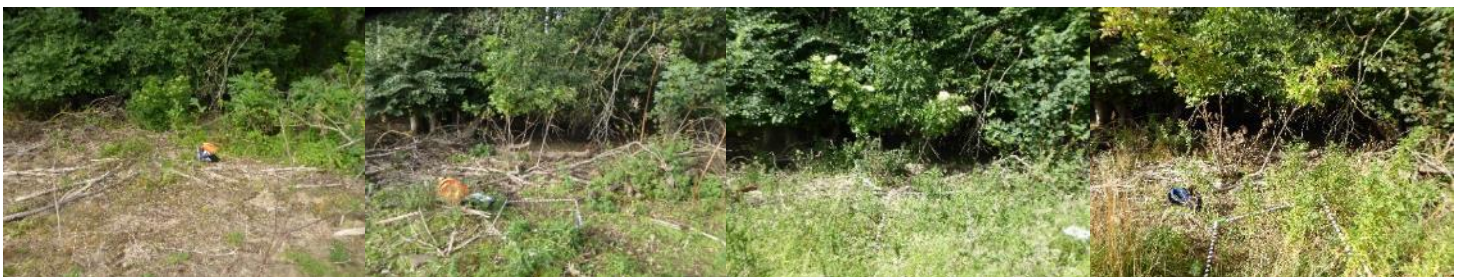
P29 - Looking left along fence

By June 2020 grasses have really come up in area