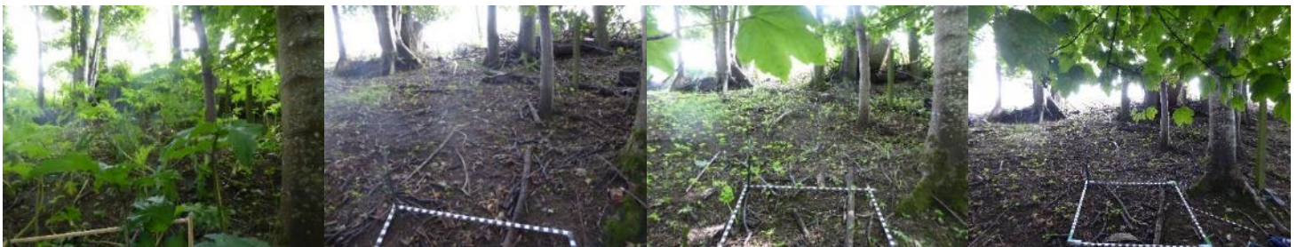
P29 – June 2019, Oct 2019, June 2020, Sept 2020 - Looking down showing elder

By June 2020 grasses have really come up in area