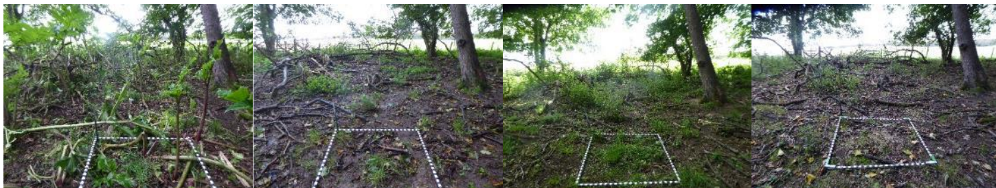
P14 —see plot photos