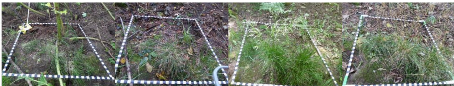
P13 – June 2019, Oct 2019, June 2020, Sept 2020