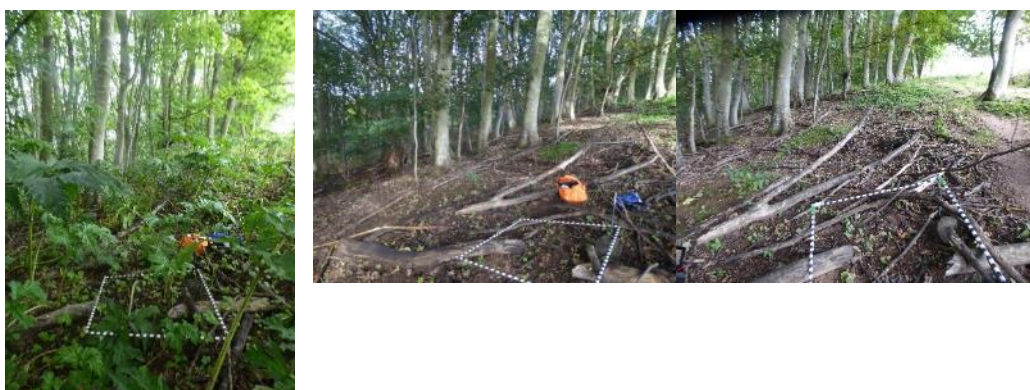
P20 - Looking up to field