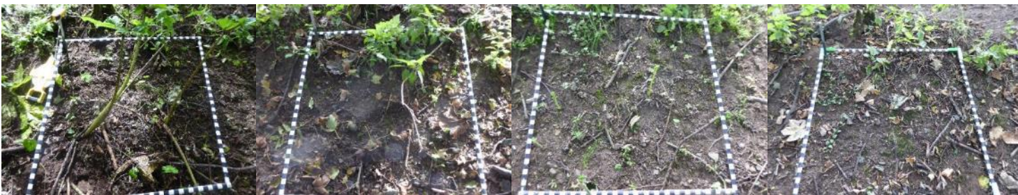
P19 – June 2019, Oct 2019, June 2020 – Not so much diff in plot but photo looking at fence shows how salmonberry has died off, Sept 2020