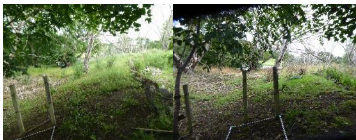
June & Sept 2020 looking back to P2

P4 – June 2019, Oct 2019, June 2020, Sept 2020 - See plot photos for 2019