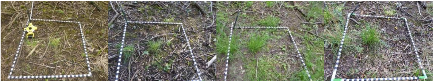
P40 – June 2019 (No photo), Oct 2019, June 2020 – Grass significantly grown up, Sept 2020