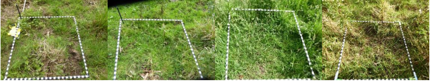
P33 – June 2019, Oct 2019, June 2020, Sept 2020