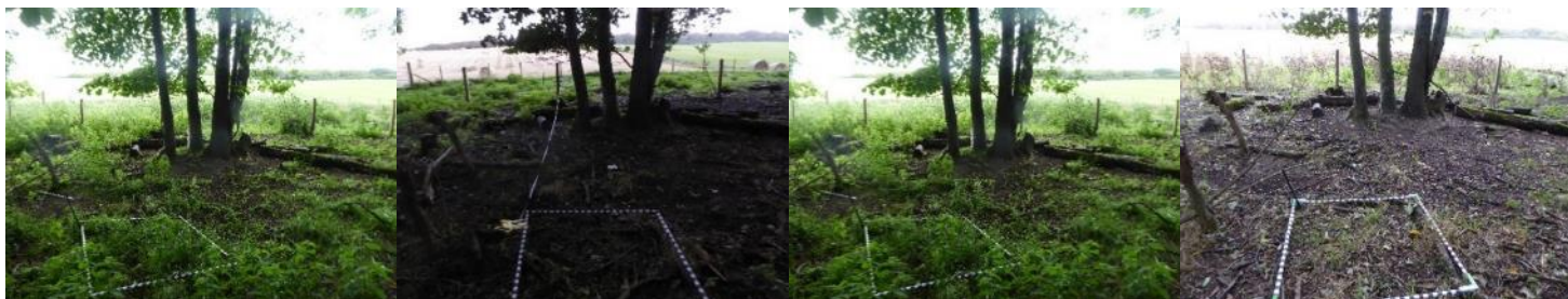
P11 – June 2019, Oct 2019, June 2020, Sept 2020 - Looking towards wall

P11 looking towards wall shows how grass has grown up significantly. Still heavily grazed but sheep paths less obvious in June and Sept 2020 than in 2019