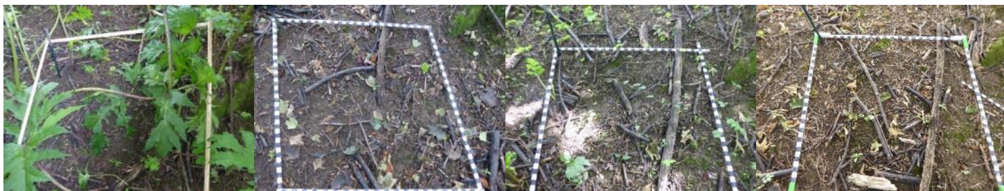
P29 – June 2019, Oct 2019, June 2020, Sept 2020